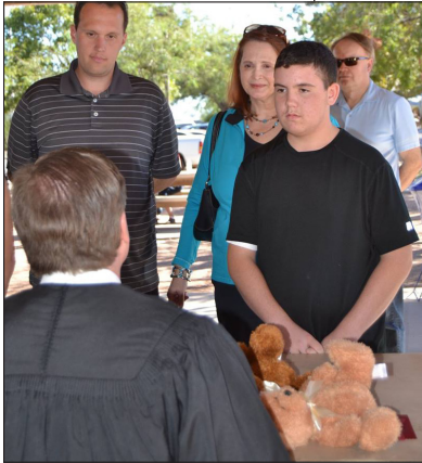
Adoption Day Photos are courtesy of the Pima County Juvenile Court.